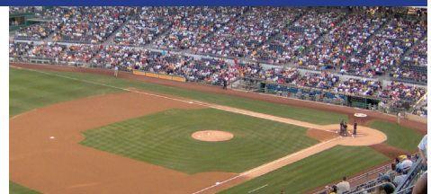
Invite 75 friends to a Texas Rangers game in Arlington.