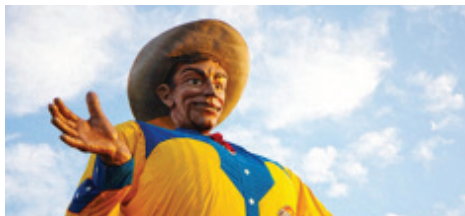
Purchase State Fair of Texas season passes for 45 friends.