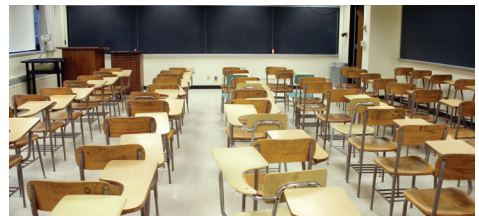
Pay for nearly two months of tuition and fees at Angelo State University in San Angelo.