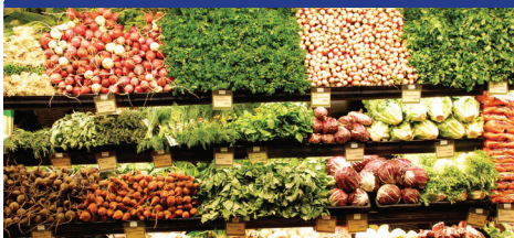
Get two months of groceries in Lubbock.