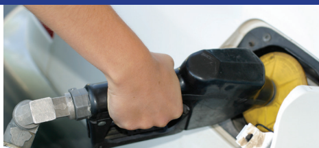
Buy 30 tanks of gas in Abilene.